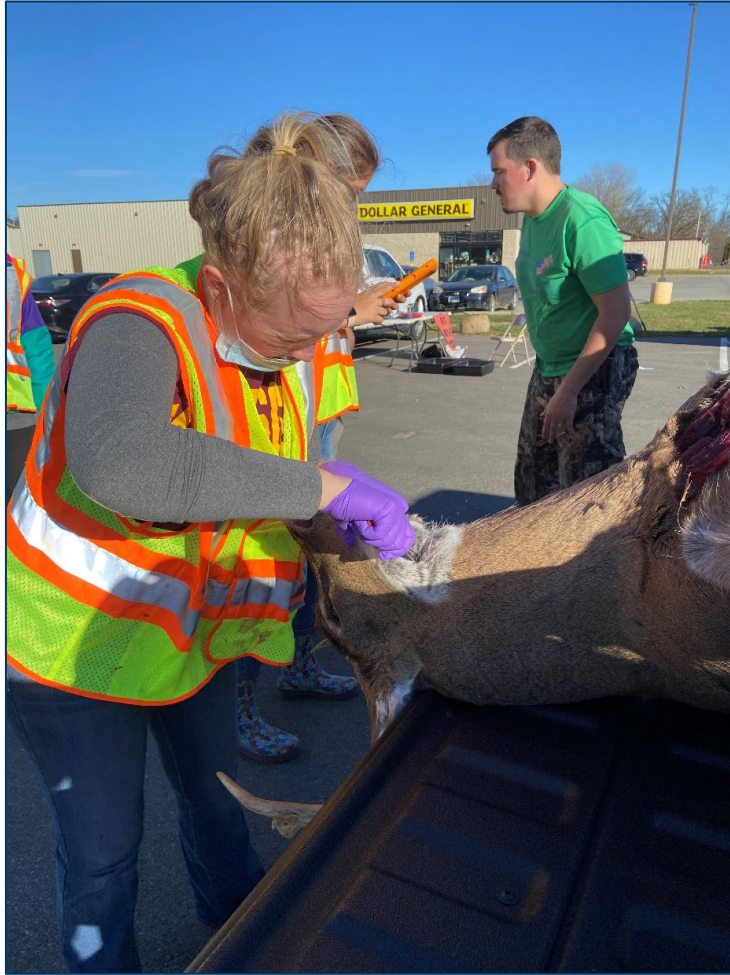
CWD sampling station