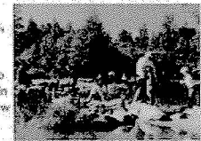
One of Minnesota's top 25 scenic attractions (as of 2008).

DNR manages state parks, recreation areas, trails, scientific and natural areas, wilderness areas, forests, wild and scenic rivers, water access sites, wildlife management areas, aquatic management areas, safe harbors and more. In all of these areas, DNR works to provide access to recreation lands and waters, sustain healthy lands and waters, promote safety, recruit new users, and inform and educate users.