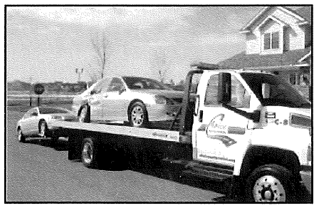
Delivery of rental & pickup of damaged vehicle