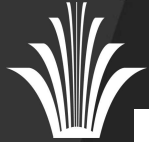
Minnesota Metro Area Public School Districts