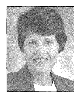
Rep. Barb Sykora