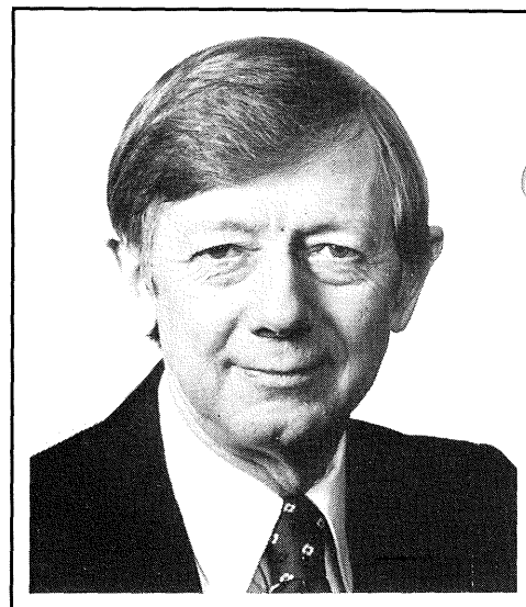
Attach a recent photo

Reelection for District 36 Portions of Scott, Dakota, Carver & LeSueur counties